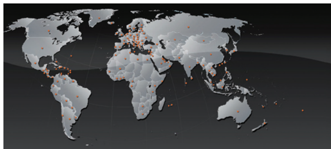
Virus World Map

FortiGuard center can be accessed at: http://www.fortiguards.com/